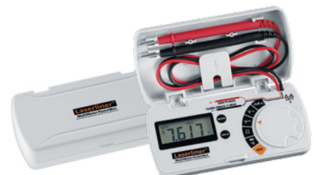
MultiMeter-PocketBox + batteries

Packing dimension (W x H x D) 107 x 234 x 52 mm