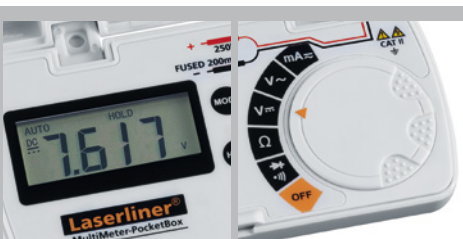
Large LC display