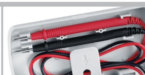
Test prod holder